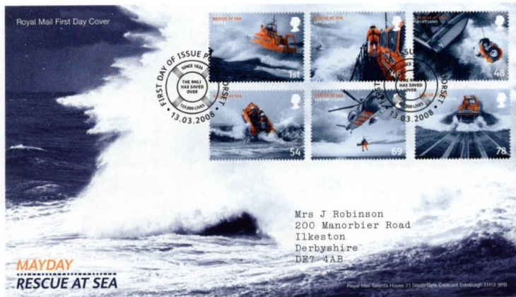
Left: the first day cover.

A presentation pack (below), designed by Hat-trick Design, provides an illustrated history of the lifeboat and coastguard services.